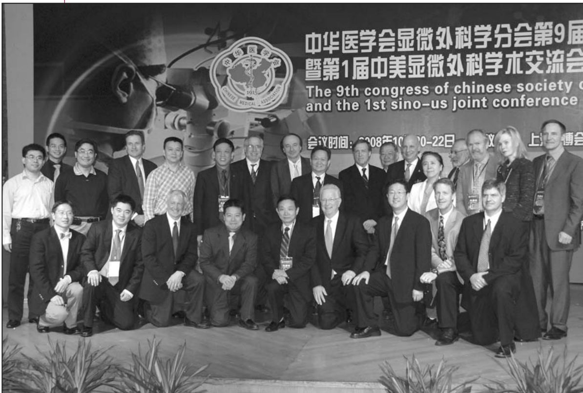
ASRM attendees at the first joint meeting with the Chinese Society of Microsurgery.

We look forward to seeing you in Maui. RM