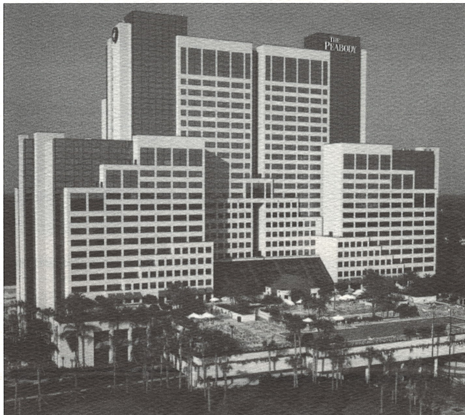
The Peabody Orlando will play host to ASRM's Seventh Annual Meeting, offering a wide range of facilities and services to members and guests.

In addition to its billing as the world's theme park capital, Orlando boasts of many fine restaurants and an impressive performing arts calendar. Area museums include the Orlando Museum of Art and the Morse Museum of American Art, which features a collection of works by painter and colorist Louis Comfort