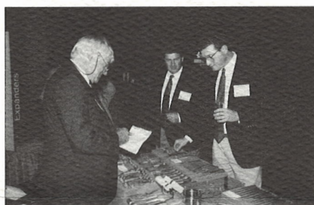
Thirteen exhibitors had the opportunity to present their products and services to meeting participants at this year's annual meeting in Toronto, Sept. 21-23.