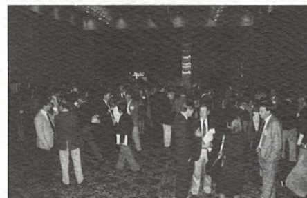
Approximately 374 society members attended this year's annual meeting, an increase of 32 percent over last year's meeting..