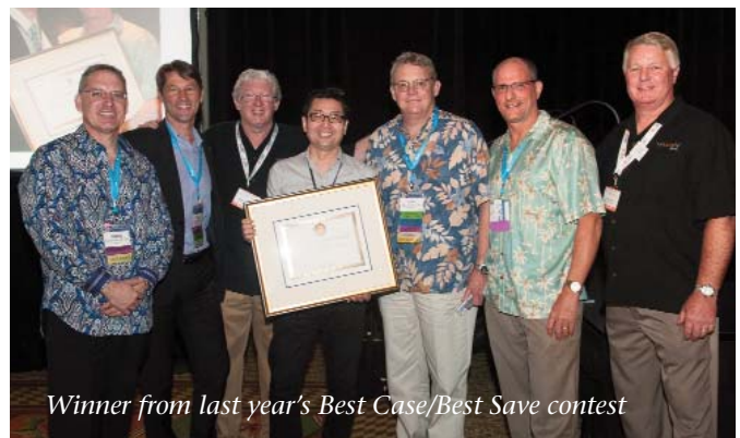
Winner from last year's Best Case/Best Save contest