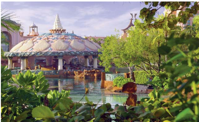
The Lagoon Bar and Grill features a painted domed ceiling.