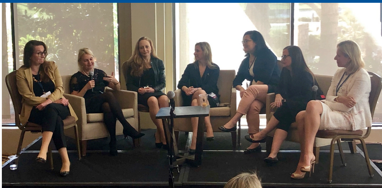
WMG Luncheon Panel discusses "Defining Career Successes and Preventing Burnout"